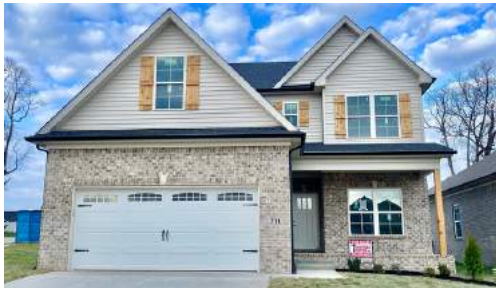
Q THE SHELLDRAKE PLAN