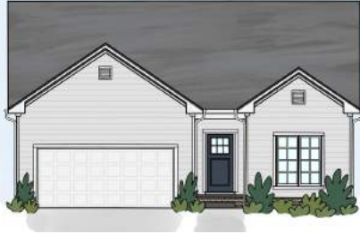
Q THE SHALLOWFORD PLAN