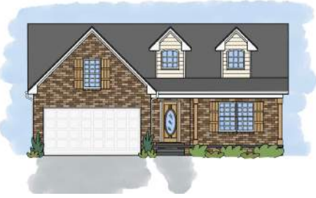
Q THE CARTER FARM PLAN