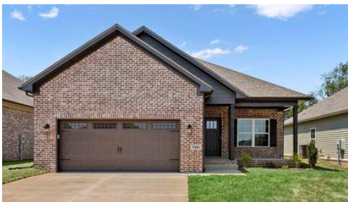
Q THE CREEKSTONE PLAN