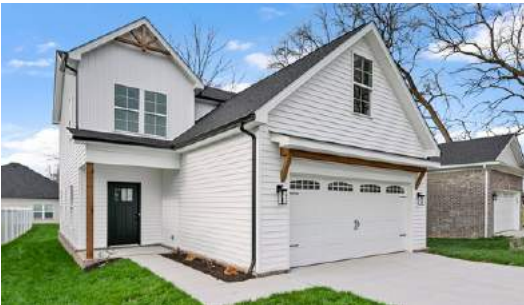
Q THE ROCK BRIDGE PLAN