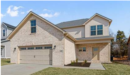
Q THE PARKS EDGE PLAN