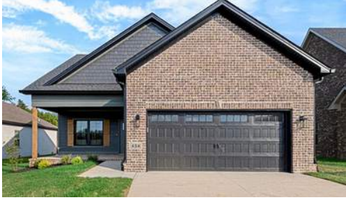
Q THE HELMSDALE PLAN