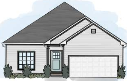
Q THE POPLAR LOG PLAN