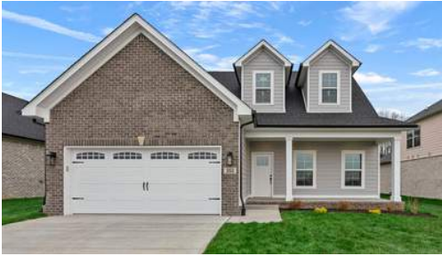
Q THE ELLINGTON PLAN