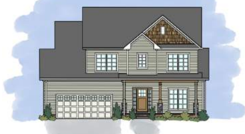
Q THE SOUTHERLYNN PLAN