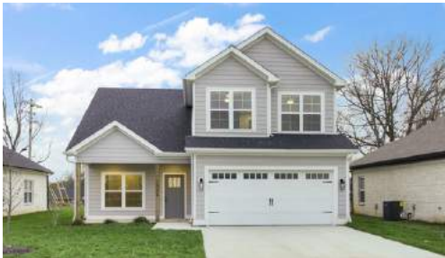
Q THE COUNTY HOUSE PLAN