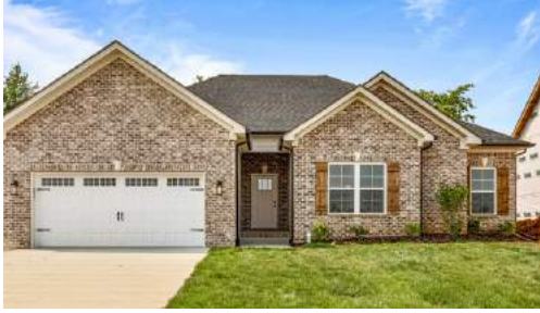
Q THE WINDSOR PLAN